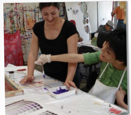
I LOVE TO CREATE!