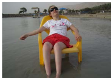
Me in the Sea of Galilee