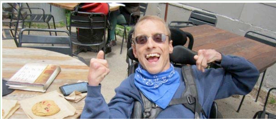
I love eating cookies!

People may not know... that my nickname is Sneaky Pete!