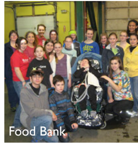
Hanging out with Ally