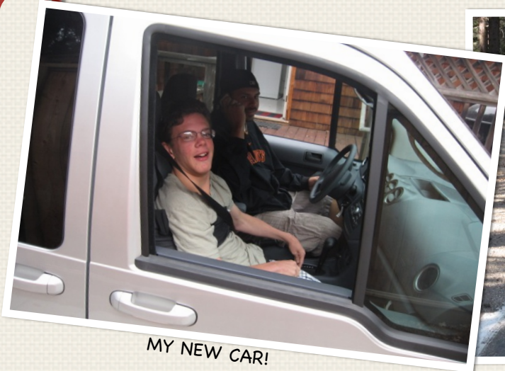
MY NEW CAR!