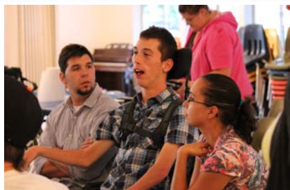
I love to share my opinion!