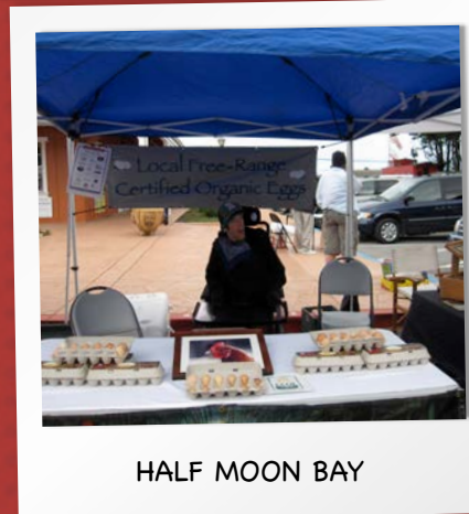
HALF MOON BAY